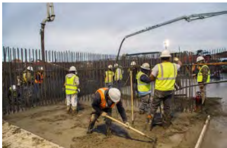
Clean water regulations require the hiring of construction workers and engineers to build and upgrade sewage treatment plants.

And the jobs lost are just one side of the coin – regulations also stimulate new hiring, for example of construction workers to build sewage treatment plants and air pollution control systems at power plants. On balance, the net effect tends to be positive. When looking at the effect of pollution control spending over time, researchers have estimated that some industries show no significant change in employment, while others, for example the plastics industry, see significant job creation.