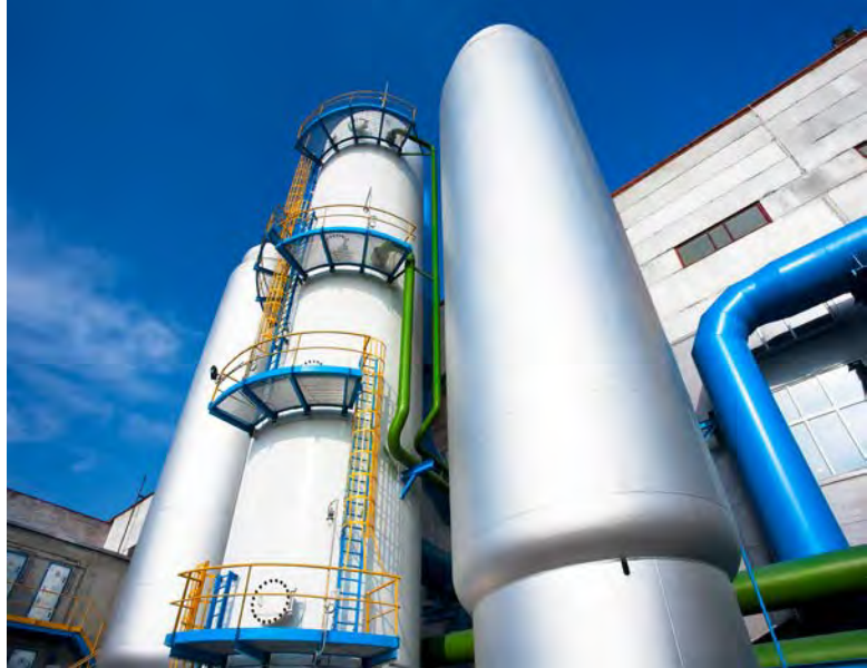
Installations of industrial scrubbers like these and other types of pollution controls have resulted in the creation of thousands of jobs in response to environmental regulations.

estimated to create the equivalent of 167 full-time jobs for 20 years, while a 4-Gigawatt (GW) wind project, including associated transmission infrastructure, was estimated to create the equivalent of 1,500 full-time jobs. 19