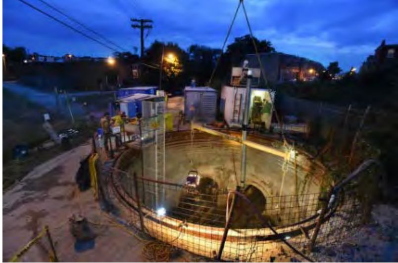
In response to the federal Clean Water Act, dozens of construction and engineering firms are working to fix leaks in Baltimore's sewage system.

The idea that regulations are bad for jobs and the economy is nonsense. The facts show that our environmental protections are immensely valuable, from an ecological perspective, from a human health perspective, and also from an economic perspective.